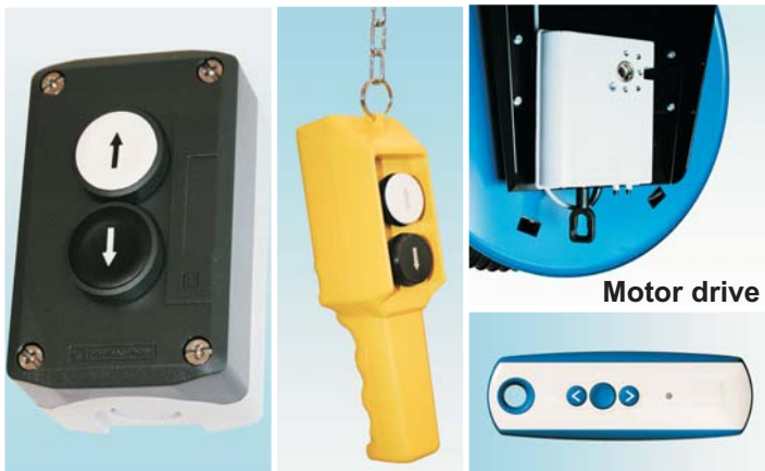
Wall mounted control device