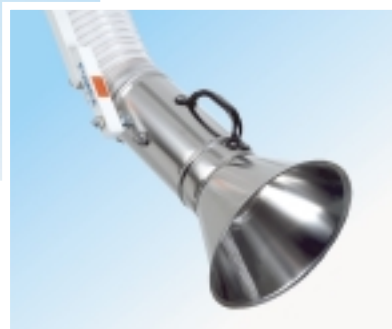
Stainless steel suction nozzle