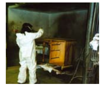
Figure 7 Walk-in booth