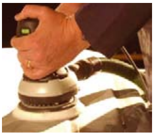
Figure 3 On-tool extraction hand sander