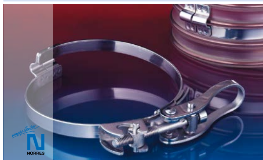
Bridge Clamp with quick-release closure for attaching externally corrugated spiral hoses

Properties: practically leak-proof and secure clamping with special bridge geometry; easily and quickly fitted; re-usable; conforms to RoHS guideline