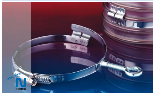
Bridge clamp with eyelet for attaching externally corrugated spiral hoses

Properties: practically leak-proof and secure clamping with special bridge geometry; easily and quickly fitted; re-usable; conforms to RoHS guideline