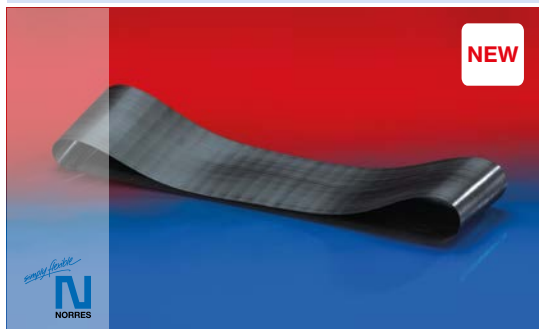
Elastic clamp protection tape

Properties: easily and quickly fitted; re-usable; highly abrasion resistant; good resistance to oil, gasoline and chemicals; conforms to RoHS guideline